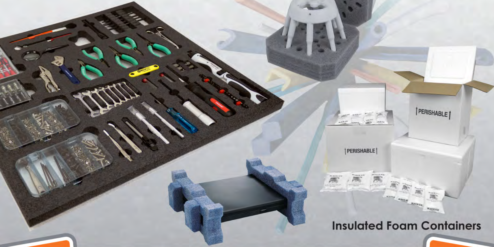
Insulated Foam Containers